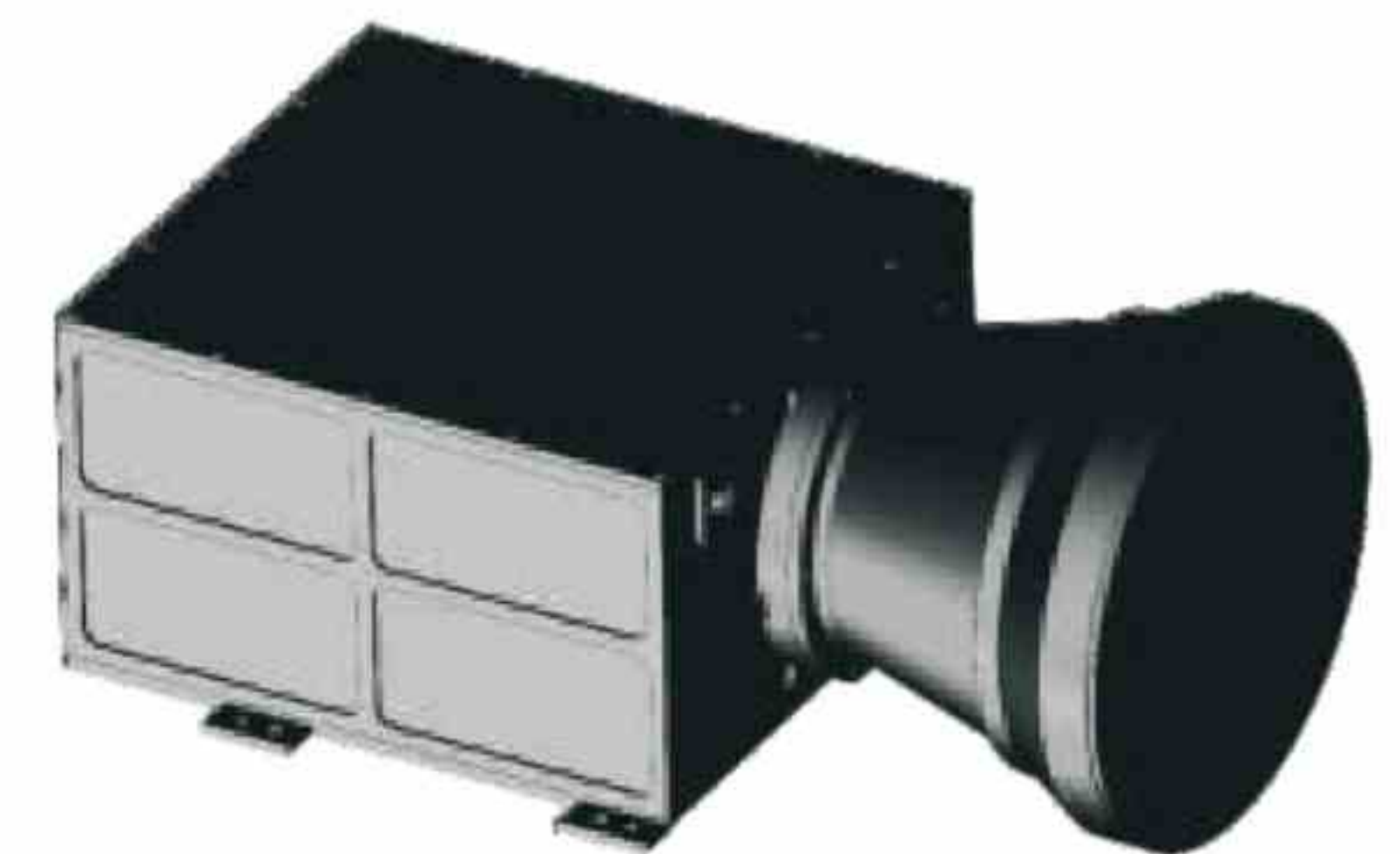
Thermal Camera Only Available

Equipped with a high resolution 640x512 HgCdTe MWIR cooled thermal camera with 1100~110mm continuous zoom lens which offers super long range security and surveillance application, capable of observation, recognition, aiming and tracking target at day and night. JH602-1100 system can work independently for ship navigation and surveillance at night, or be integrated into a larger surveillance system, capable of receiving slaving instruction from radar.